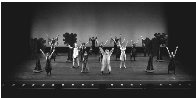
"The Jitterbug" at the Connor Palace Theatre - 2019 Best Musical Nominee

For more info on the Dazzle Awards, visit playhousesquare.org , under the Education tab!